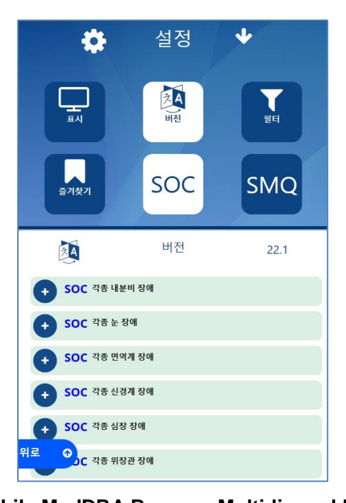
Figure 3-1 Mobile MedDRA Browser Multi-lingual User Interface

The MSSO deployed a web-based mobile version of MedDRA Browser (MMB) in April 2019 designed to work on smartphones and tablet computers. In January 2020, the MMB was updated with a multi-lingual user interface (UI) for use on iOS and Android mobile devices. Users may choose any of the MedDRA languages as the UI language, including Chinese, Czech, Dutch, English, French, German, Hungarian, Italian, Japanese, Korean, Portuguese, Russian, and Spanish. In March 2020, with the release of Brazilian Portuguese MedDRA, the UI will also be available in Brazilian Portuguese.