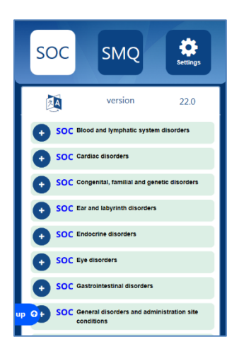
Figure 3-1 Mobile MedDRA Browser

To access the MMB, simply login using your MedDRA ID and Password. This password is the same password used to access the MedDRA website and other applications such as the Web-Based Browser and MVAT. If you don't know your User ID and Password, please use the MedDRA Self-Service Application.